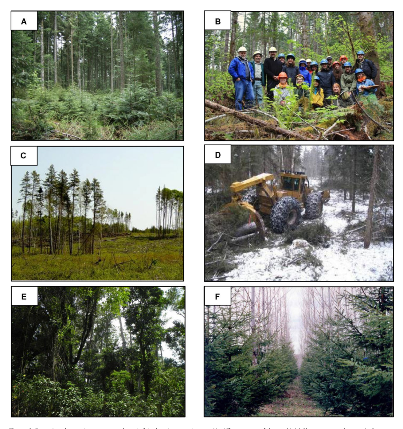
Figure 2 Examples of emerging ecosystem-based silvicultural approaches used in different parts of the world. (a) Close-to-nature forestry in Germany, which focuses on reduced human intervention through single tree management; (b) Thinning even-aged Douglas-fir stands in Oregon, United States, to increase small-scale spatial variability; (c) Variable retention forestry in the boreal forest of Canada to ensure life boating of sensitive species; (d) Partial cutting in a mixed-wood boreal forest of Canada designed to reflect natural-disturbance-based forest management; (e) Natural regeneration of native species in the understory of a Eucalyptus plantation in Brazil as a way of restoring Atlantic Forest; and (f) Multispecies forest plantation of poplar and spruce in Canada to encourage both structural and compositional diversity (for a more detailed assessment of emerging management trends, see Messier et al. 2013).